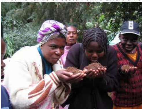
Figure 3: Inspecting mixed compost.

In some forms of ecosan urine diversion does not take place and the faeces are mixed with